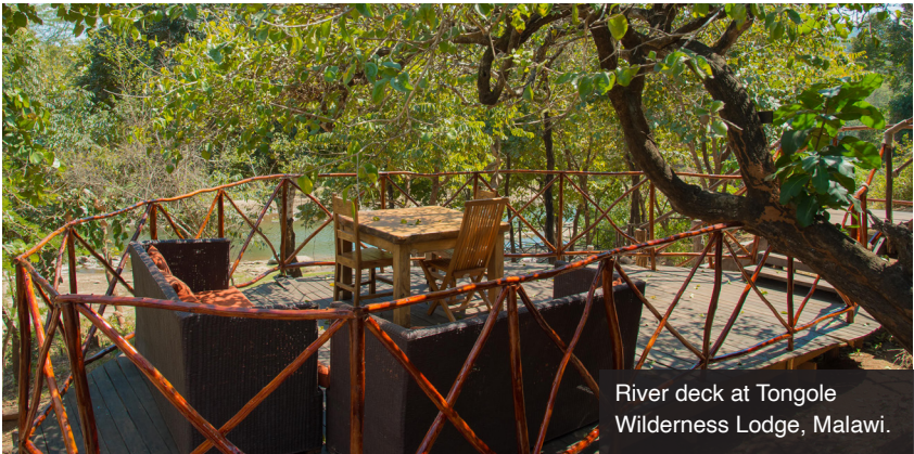
River deck at Tongole Wilderness Lodge, Malawi.